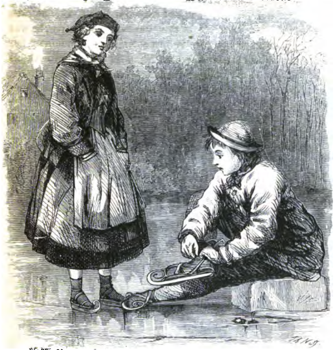
The Sacrifice. p. 275.